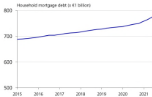
Chart 1: Total mortgage debt