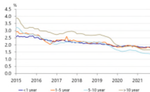
Chart 4: Interest rate on new mortgage loans