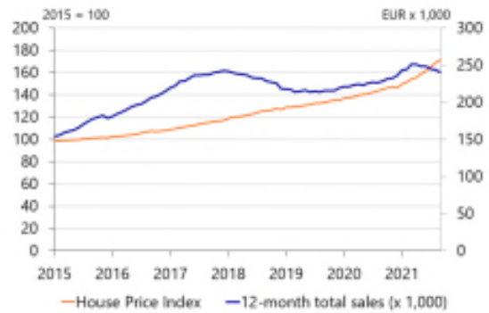
Chart 2: Sales