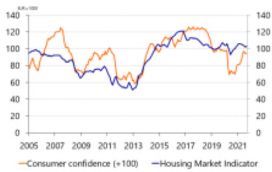
Chart 6: Confidence