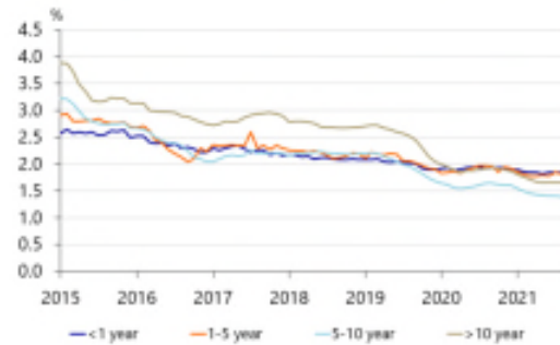
Chart 4: Interest rate on new mortgage loans