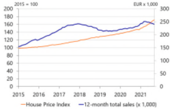
Chart 2: Sales