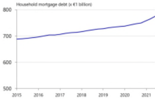
Chart 1: Total mortgage debt