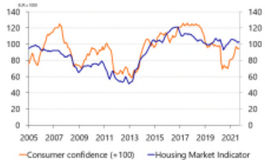
Chart 6: Confidence