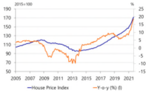
Chart 3: Price index development